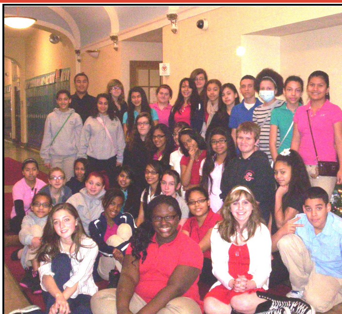
The cast of Couch Potato Santa poses for a group shot a few weeks before the show opens to audiences on December 20.